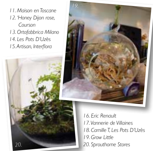
11. Maison en Toscane 12. 'Honey Dijon rose, Courson 13. Ortofabbrica Milano 14. Les Pots D'Uzès 15. Artisan, Interflora 16. Eric Renault 17. Vannerie de Villaines 18. Camille T, Les Pots D'Uzès 19. Grow Little 20. Sprouthome Stores

11. TERRARIUM: Harkening back to Flower Power days, we are again attracted to creating mini vegetal worlds within a glass container. (photos 19/20) - Indoor terrariums in large, blown-glass bubbles are like small planets that captivate the imagination. - Terrariums can be tiny, implanted in transparent decorations that hang like minuscule museum displays. - Terrariums can also be created outdoors, like gardens within a garden. •