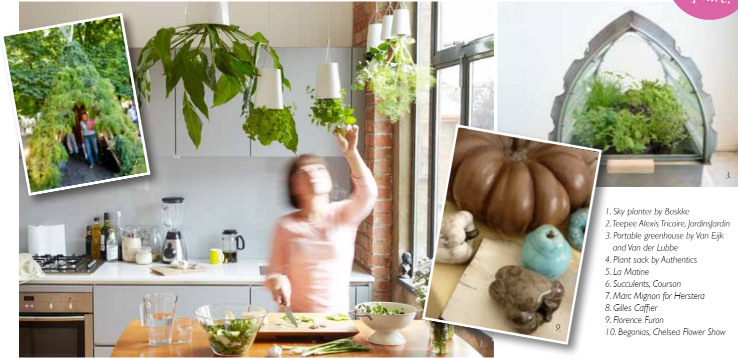
1. Sky planter by Boskke 2. Teepee Alexis Tricoire, Jardinsjardin 3. Portable greenhouse by Van Eijk and Van der Lubbe 4. Plant sack by Authentics 5. La Matine 6. Succulents, Courson 7. Marc Mignon for Herstera 8. Gilles Caffier 9. Florence Furon 10. Begonias, Chelsea Flower Show